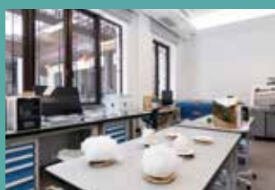
Innovation and design center 创新设计中心