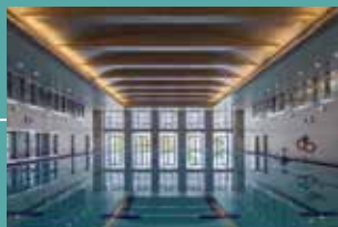
Swimming pool 游泳馆