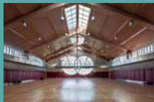
Indoor basketball court 室内篮球场

为彰显可持续和环保理念，校园内配备了地热供暖系统、屋顶太阳能电池板、混合太阳能电池板和风车路灯、智能中央空调等尖端技术产品。