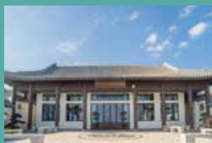
Yushan Academy 虞山书院